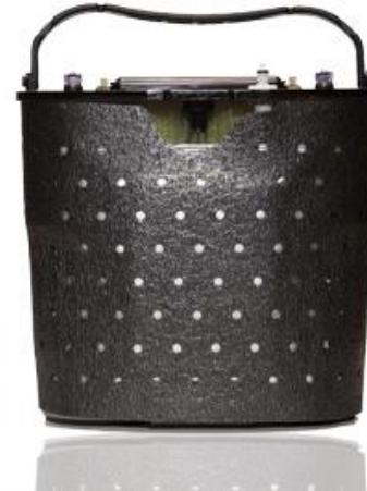
Replacement cartridge for OxySure Model 615