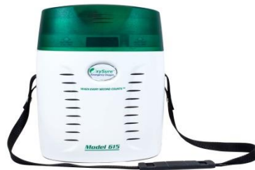
OxySure Model 615, Europe version