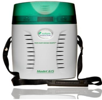
OxySure Model 615, US version